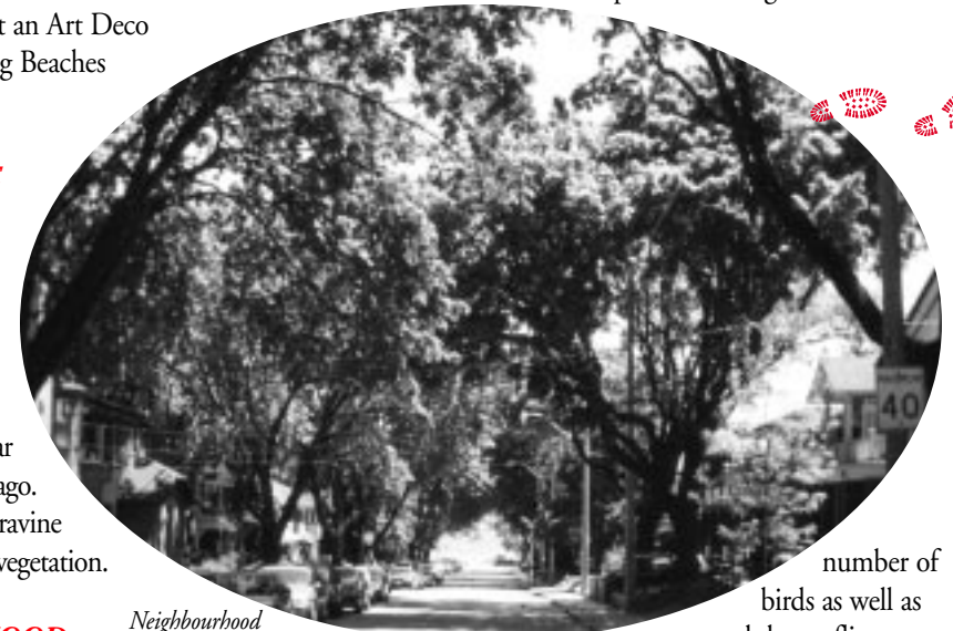
Neighbourhood tree-lined street

Lake Ontario is part of the largest freshwater system in the world. Look for evidence of the lake's energies in the continually shifting beach alignment and the shoreline protection methods. Wind and water are slowly eroding the nearby Scarborough Bluffs. Sand deposits from the bluffs have helped form the Beaches waterfront and Toronto Islands. The lakeshore and nearby Glen Stewart Ravine are important migratory stopovers for a significant