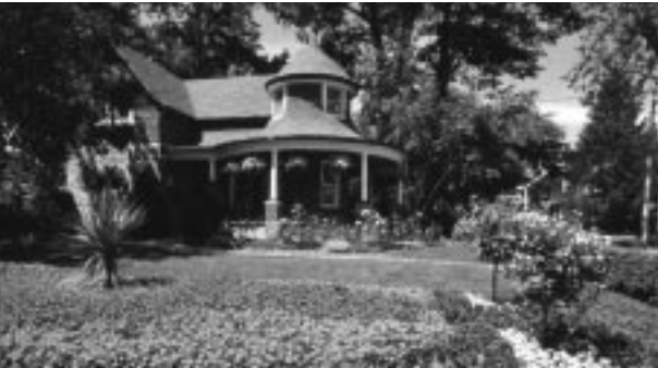
Gardener's House, Kew Gardens

You can reach the suggested starting point on public transit, by taking the 64 MAIN bus south from Main Street Station on the BLOOR/DANFORTH subway and get off at Kingston Road. The 501 QUEEN streetcar east from Queen Station on the YONGE subway also provides service into the area including the suggested tour end point.